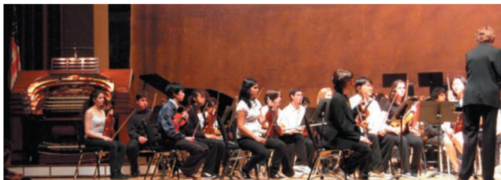
Berkeley High School Symphony Orchestra