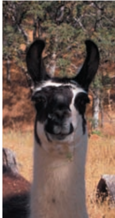
Who am I— Junkyard, Dolly, Fraulein, or Duke?