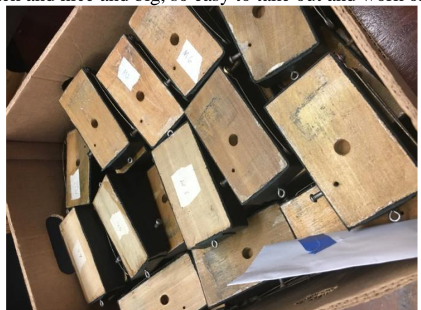
A "Box o' Bumpers", ready for re-installation

Early this year we re-leathered the swell shade "bumpers" that cushion the shades as they close so that they don't slam. They work like small leather air bags with a controlled leak (screw and bleeder hole) so that the shades actually will close. The bumpers are easy to reach and nice and big, so easy to take out and work on.