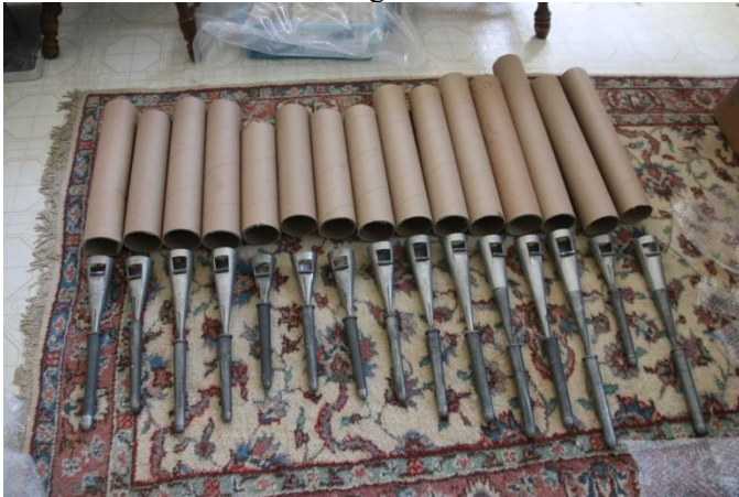
Repaired Tuba pipes

Sometimes we find that we don't have the expertise to do something and have to contract for repairs. We found ourselves in that situation with the top octave of our Tuba pipes. Many would stop speaking just as they came into tune. Scrolls were already open all the way and the reed tricks we know didn't help enough. So we sent the pipes to OSI, who cut new reeds and cleaned up the scrolls and did those things that we can't do.