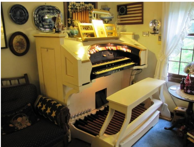
The Marr & Colton console