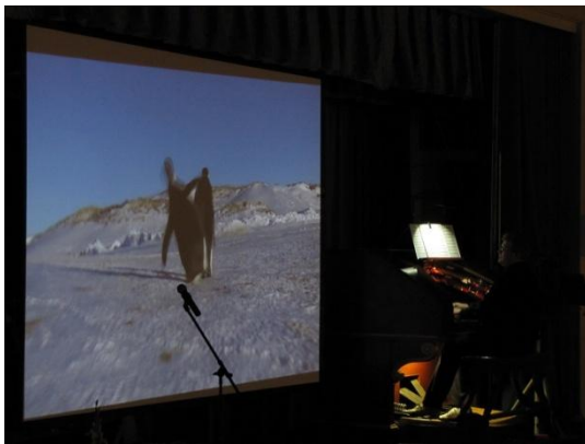
Chris Pelonzi accompanies silent short film "Penguins Playtime"