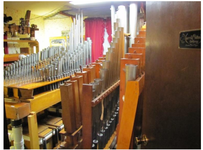
Marr & Colton pipe chamber