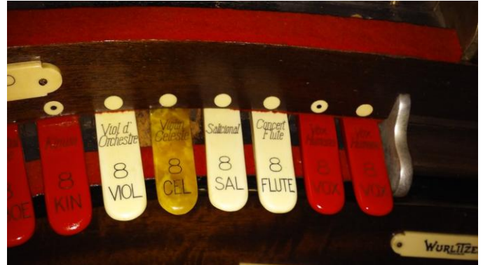
That yellow Violin Celeste tab was replaced